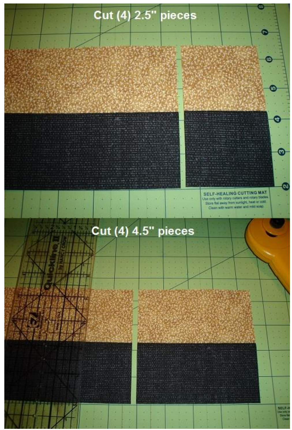
You will have just a little scrap at the end to toss! Very little waste!

3. Next, cut (4) 2.5" segments and (4) 4.5" segments.